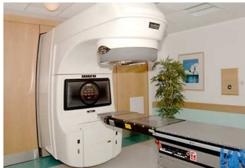
Picture of a radiotherapy machine

The main side effects of radiotherapy include bladder and rectal toxicities which can result in urinary and bowel dysfunction. Within one or two months following completion of treatment, most men notice that symptoms disappear. If changes in bladder or bowel function persist, they are typically mild. About 20 percent of men, however, do experience more significant long-term bowel irritability. The incidence of erectile dysfunction also appears to be similar to that of surgery, ranging in 20 to 50%.