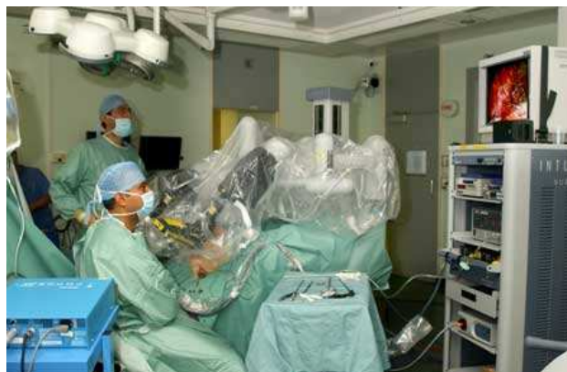
A picture showing the da Vinci™ robot

Surgery remains the primary option for many men with localized prostate cancer. In radical prostatectomy, the entire prostate gland is removed as a unit with the seminal vesicles and portions of the vas deferens. This can be done via open operation, laparoscopically (using minimally invasive surgery), or laparoscopically with the help of a robot (robot assisted laparoscopic prostatectomy). Compared to other treatment methods such as radiotherapy, a radical prostatectomy has the advantage of providing accurate local staging as well as assessment of pelvic lymph nodes through a detailed pathologic analysis. For patients with prostate cancer pathologically confined to the prostate, the chance of cure with surgery alone at 10 years (undetectable PSA) is more than 90 percent.