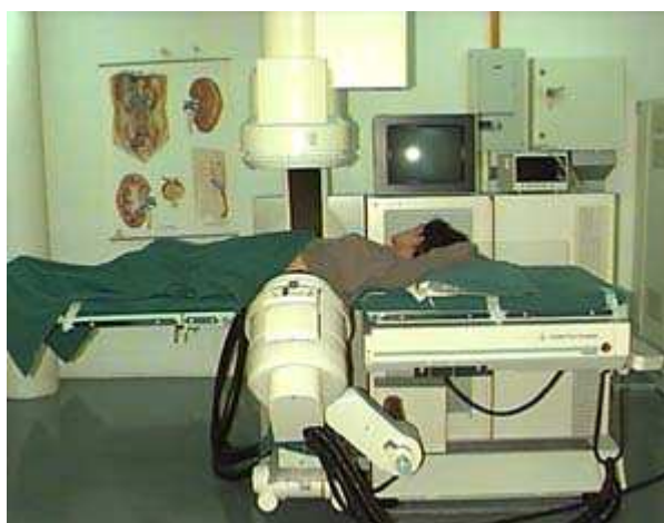
A picture showing a patient lying on the ESWL machine

Normally, no anaesthetic is necessary and you will be awake throughout the procedure. Treatment is normally carried out after the administration of painkillers. The treatment will be monitored by the lithotripsy technician. The shock waves can cause deep discomfort in the kidney and a sensation of being flicked with an elastic band on the skin of your back. Treatment normally lasts between 30 and 45 minutes, depending on the size of your stone(s).